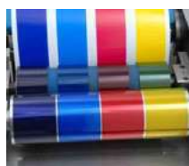
Lithographic printing inks

Gujarat Fluorochemicals has successfully developed best available manufacturing processes to offer a versatile range of PTFE micropowders – INOLUB™ T. The excellent dispersibility of these products confers the classic low coefficient of friction characteristics of PTFE, enhancing the properties of a variety of substrates including thermoplastics, thermosets, inks, paints, coatings, and elastomers.