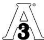
3A - Sanitary standards for design and fabrication of equipment